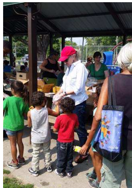
UUSS Volunteers serving kids lunch at Jerry Burrell Park in Hamilton Hill last Summer 2015